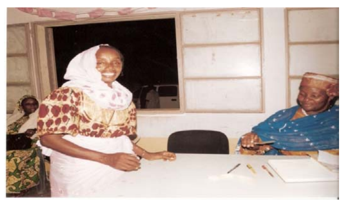
The Minister holding the knife presented to her