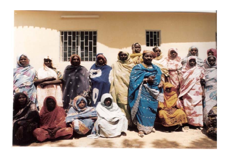
Group photo of the Minister with the circumcisers