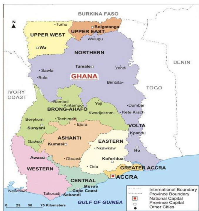
Figure 1: Map of Ghana showing National Capital, regional Capitals and other Cities

Ghana's geographic location as reported in the previous report remains the same (the details are as duplicated in the map figure 1 )