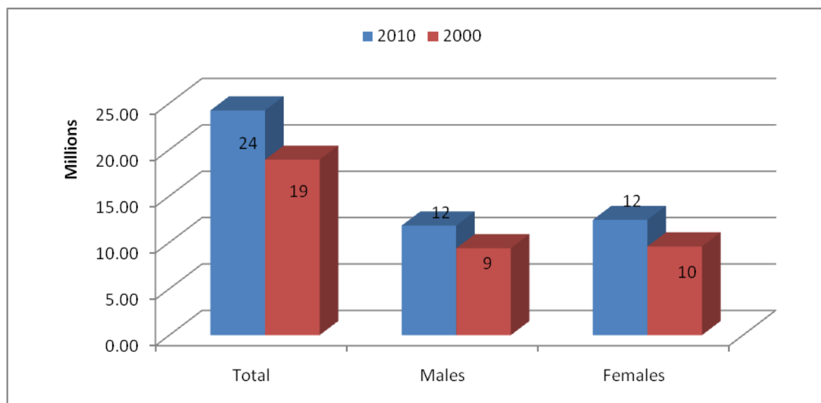
Figure 1: Population of Ghana by Sex ( 2000 & 2010)