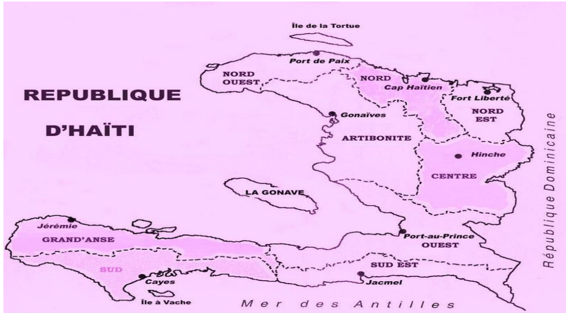
Map of the Republic of Haiti