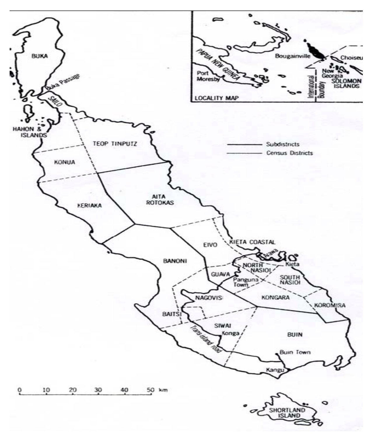
Part B – Autonomous Region of Bougainville

From: The Journal of Pacific Studies Vol. 28 no.2, 2005